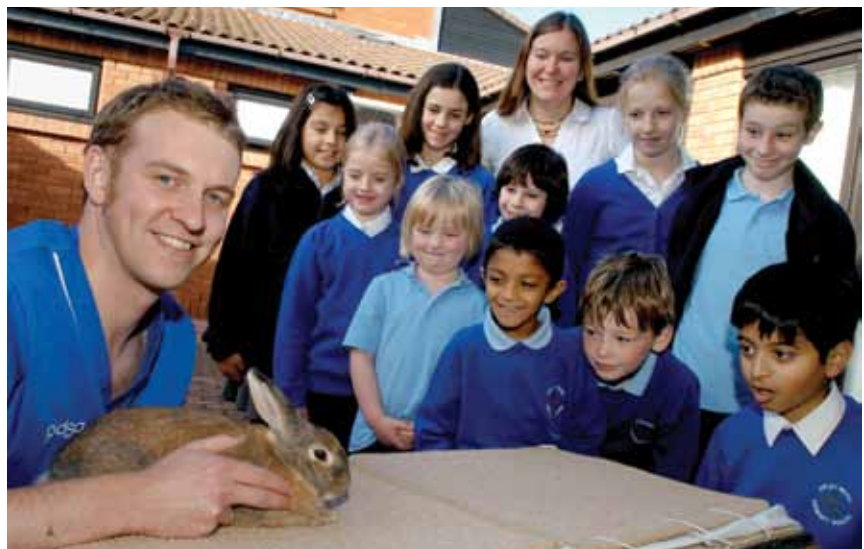
▲ Children were encouraged to learn more about caring for pets

Leaflets and a special email about the new Programme were sent to over 2,000 schools who have been involved with PDSA in the past. Facebook updates and website homepage banners also helped spread the word. The Education Programme website also gained a top award from Schoolzone, one of the UK's leading education websites.