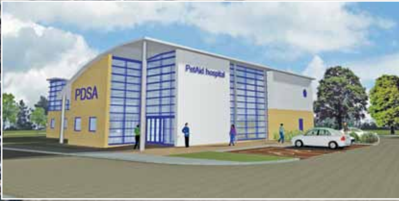
▲ An artist's impression of our latest PDSA PetAid hospital design